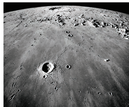
pages 365 &amp; 400